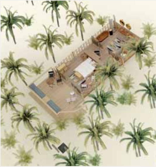
TENTED GARDEN SUITE