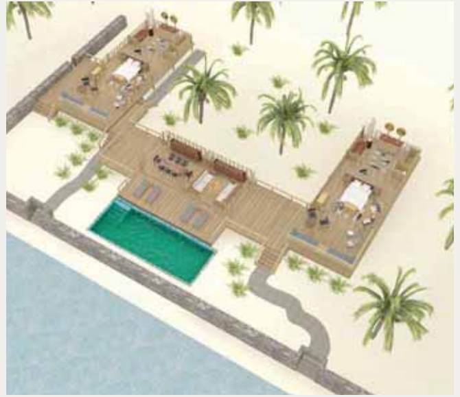
TWO-BED INFINITY POOL VILLA