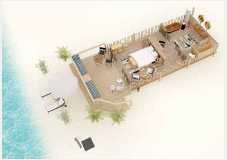
TENTED BEACH SUITE