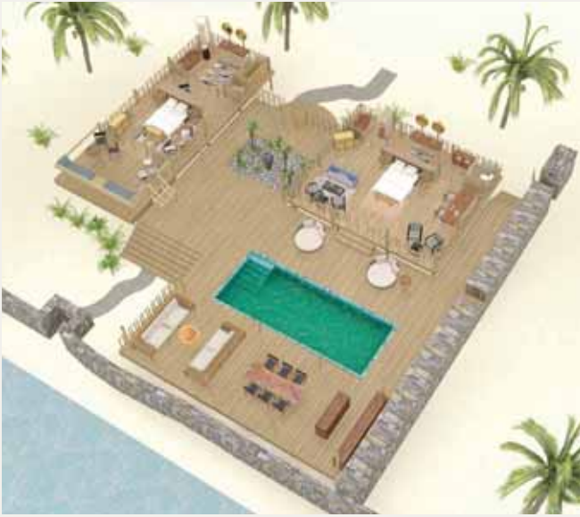
TWO-BED DELUXE POOL VILLA